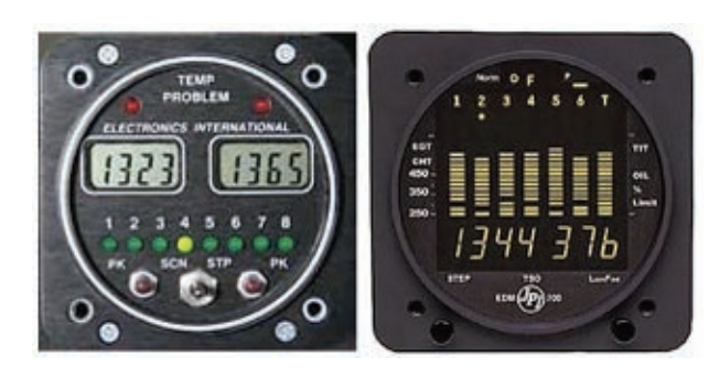
El's US-8 Ultimate Scanner displays absolute digital EGT information, as does JPl's EDM-700, and subsequent generations of digital engine monitors have all done the same.

Things started getting confusing when Electronics International (EI) introduced its Ultimate Scanner that provided digital (rather than graphical) readouts of EGT, and touted its 1-degree Fahrenheit accuracy as being far superior to the 25-degree granularity of the GEM's bar graph. (Never mind that the absolute EGT values it was reporting so accurately were essentially meaningless.) Not to be outdone, J.P. Instruments (JPI) introduced its EDM-700 that featured both a GEM-like bar graph and an Ultimate Scanner-like digital readout on the same instrument (See Figure 2). The EDM-700 was a smashing market success and forced both EI and Insight to respond with similar products (the UBG-16 and GEM 610, respectively).